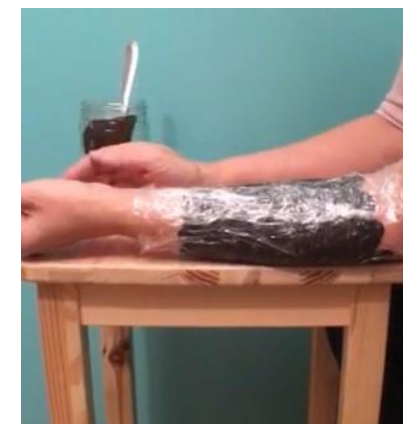
Figure 3. Peloid application